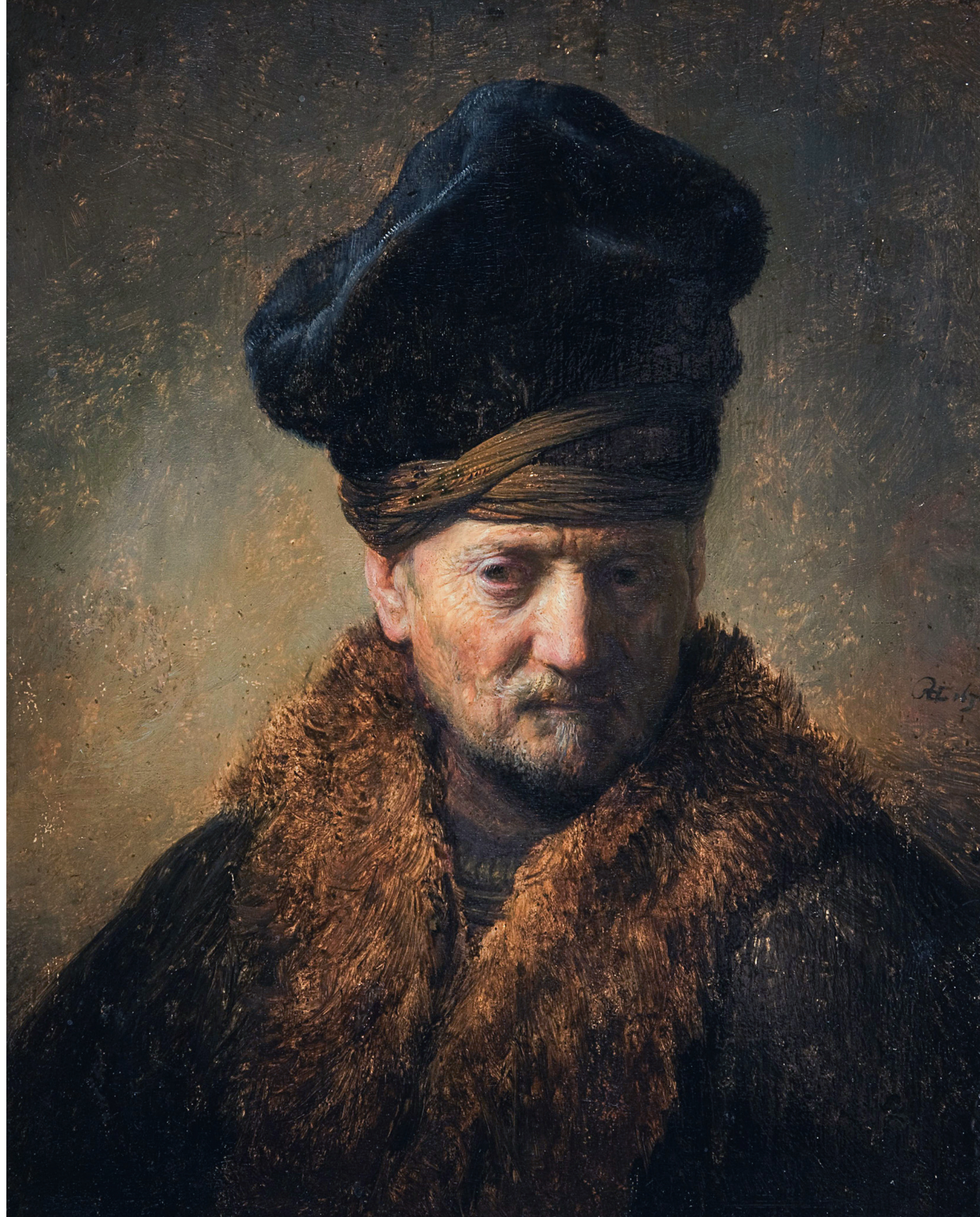
Bust of an Old Man Wearing a Fur Cap Rembrandt, c. 1629