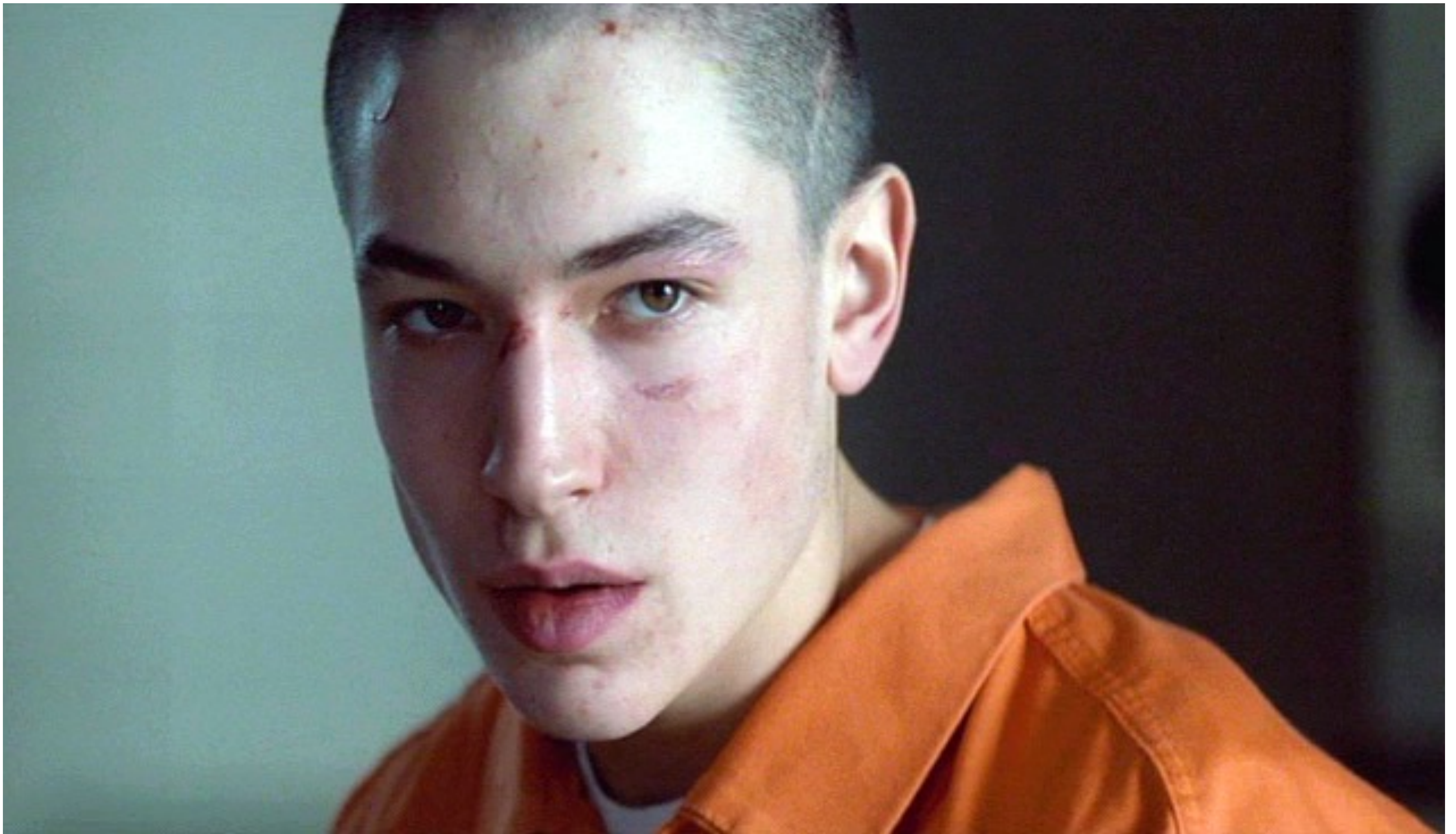
Still frame from We Need to Talk About Kevin (Directed by Lynne Ramsay, 2011)