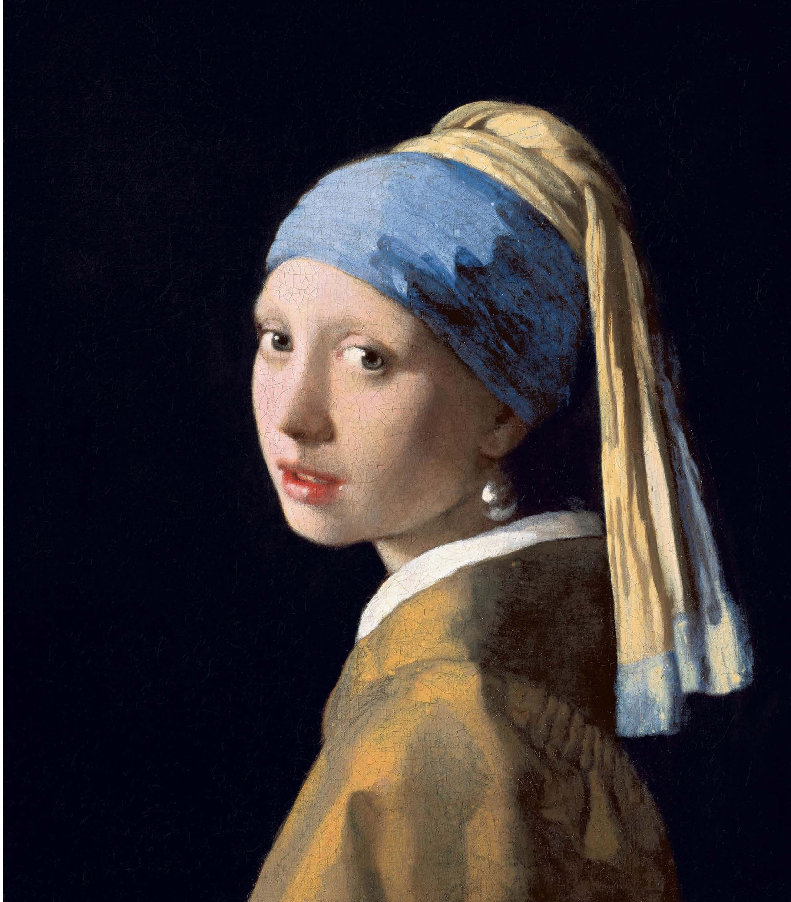
Girl with a Pearl Earring Vermeer, c. 1665