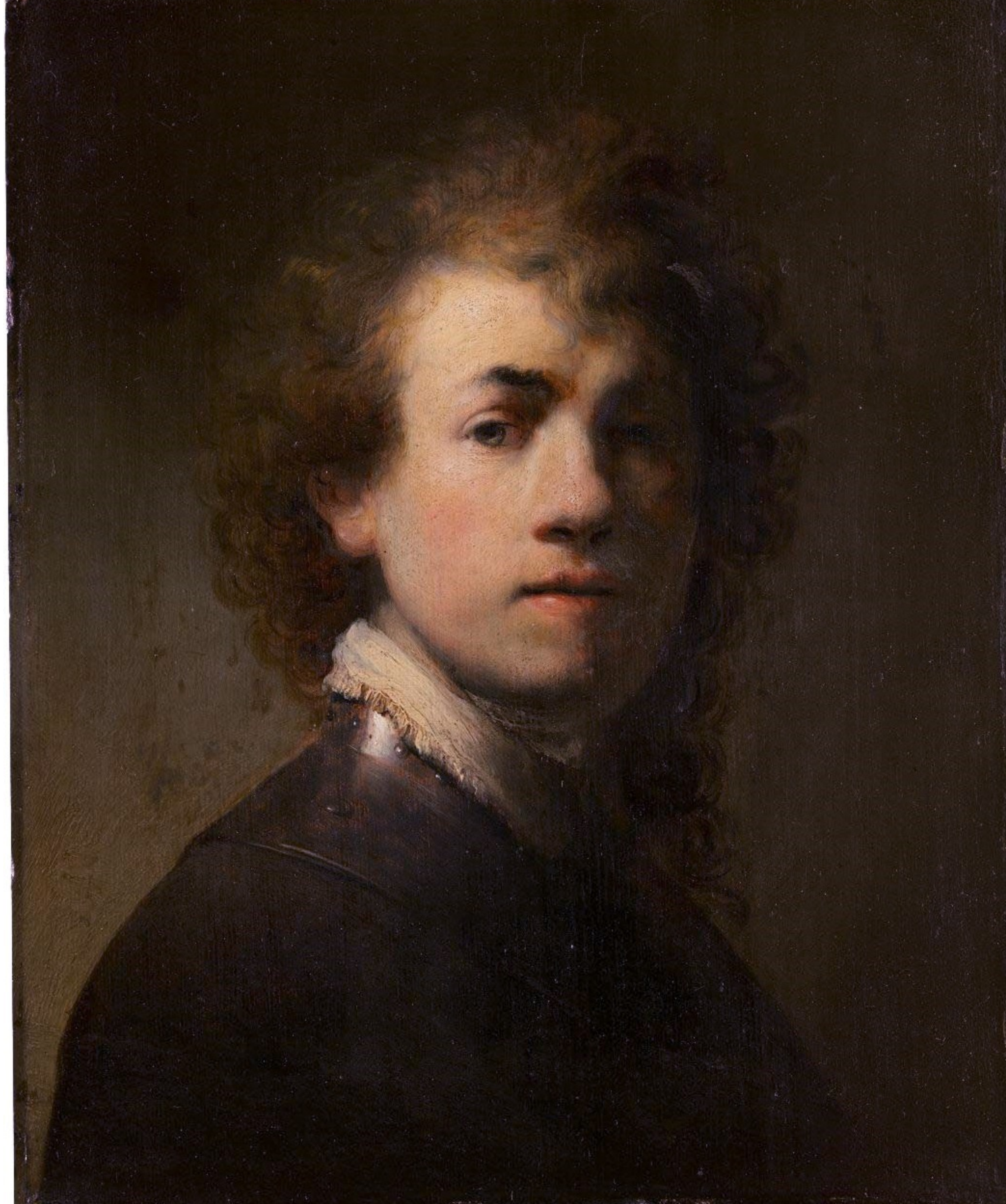
Self-portrait with a Gorget Rembrandt, c. 1629